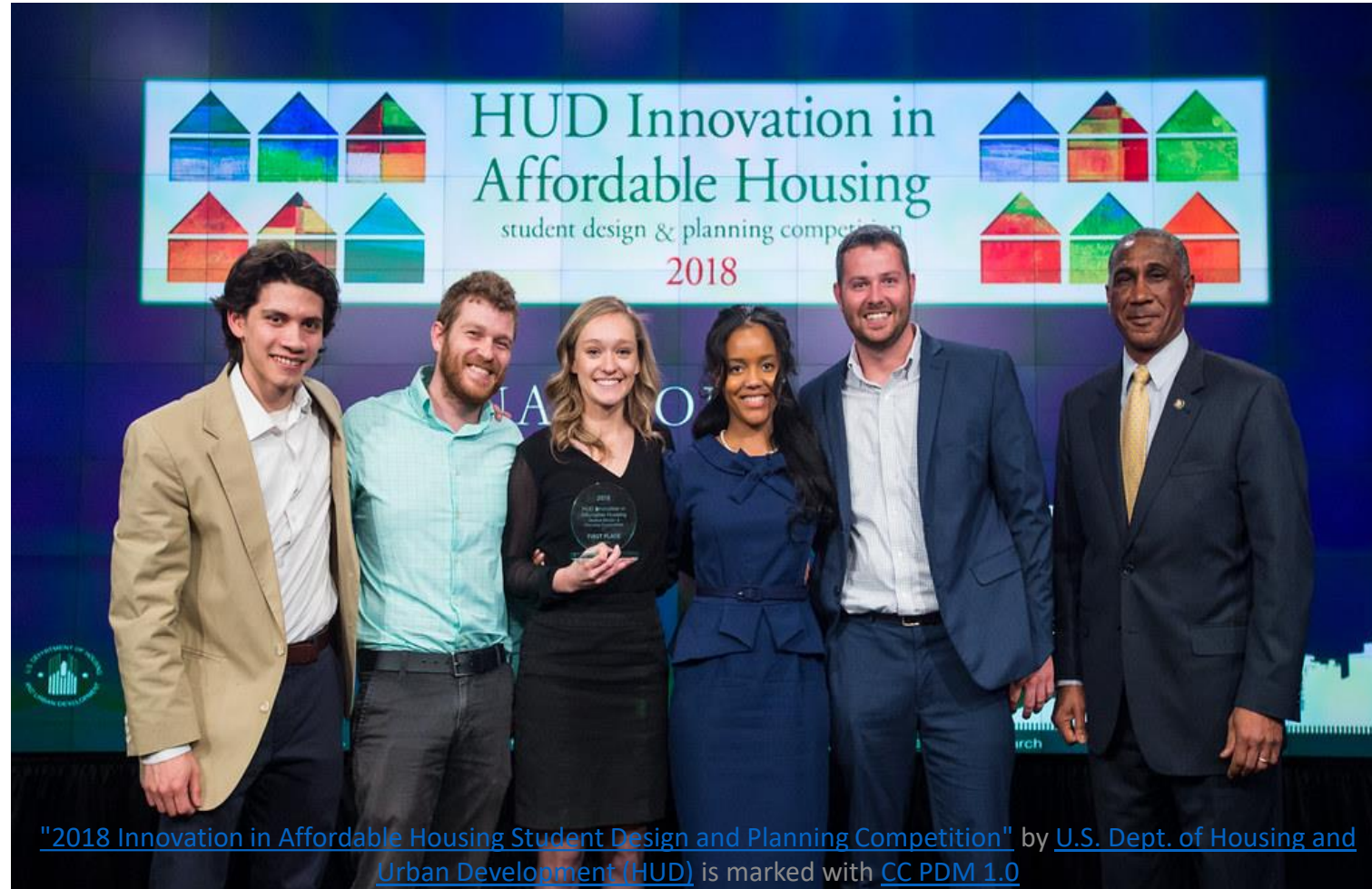
"2018 Innovation in Affordable Housing Student Design and Planning Competition"