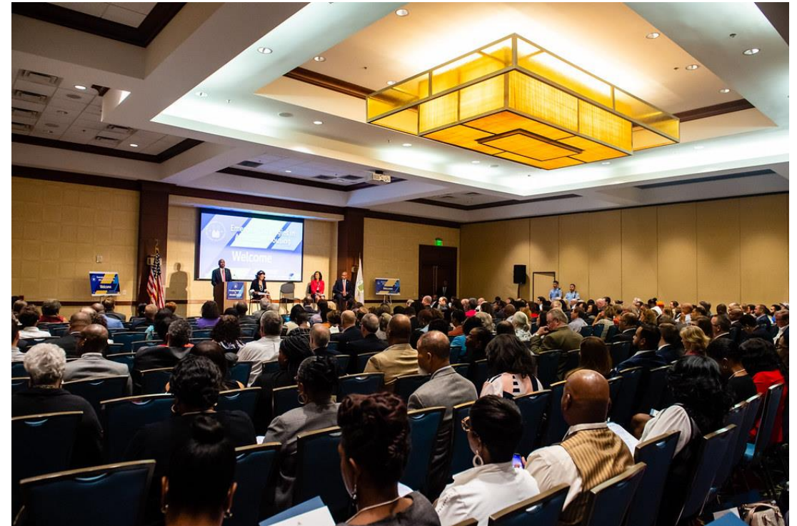
"Secretary Carson at the Emerging Strategies in Affordable Housing Expo in Atlanta"